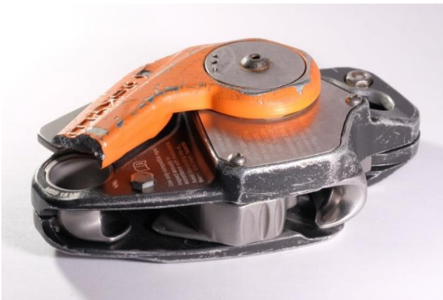
5. Broken handle