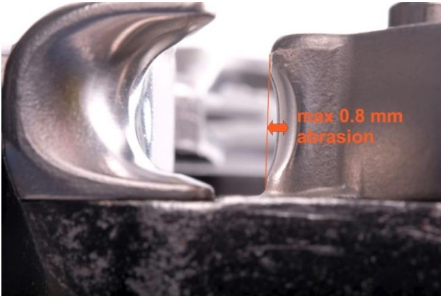
1. Abrasion of the cam's jamming bulge and rope inlet.