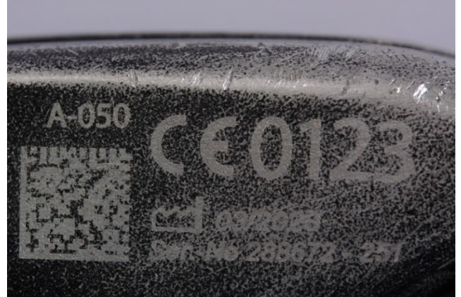
4. Non-readability of marking inscriptions