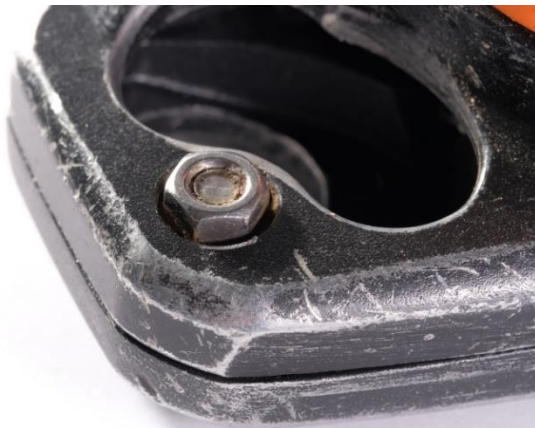
3. Non-original parts - alteration of the product