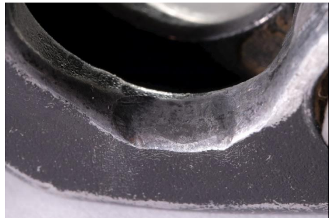
6. Deformed attachment hole